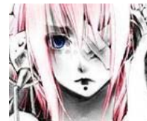
Manga fans get something new to collect: a doctorate