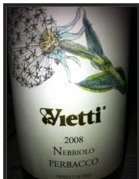
Vietti Perbacco Nebbiolo 2008

The company says these qualify for Barolo as the vineyard sources include Bricco Boschis, Ginestra, Mosconi, Liste, Brunella, Crocetta, Permanno di Fossati and Ravera di Novello e Scarrione. Obviously the better selections and vineyards become the Barolo.